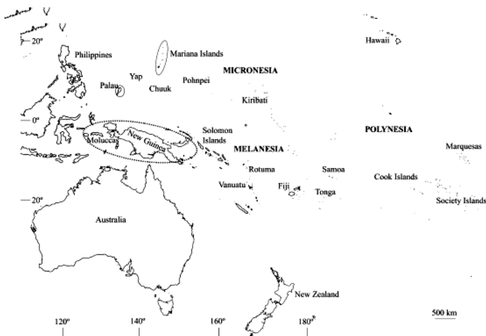
Fig. 1: Natural range of Artocarpus camansi and A. mariannensis , indicated by dashed and solid lines, respectively ( A. camansi may also be native to the Philippines and Moluccas). From Zerega et al. 2004.

A third species, A. camansi Blanco (breadnut) is a spiny, seeded form. Zerega et al. (2005), referring to Jarrett (1959b), maintain that it is indigenous to New Guinea where it is common in the lowlands, growing in flooded riverbanks, secondary and primary growth forest, freshwater swamps and in cultivation (Fig 1). It may also be indigenous to the Moluccas and introduced to the Philippines; it is absent from Micronesia, but occurs occasionally as an introduction in the South Pacific and widely in the Caribbean, Central and South America and coastal West Africa (Leakey 1977; Ragone 1997). Its chromosome number is 2n = 56 and viable seeds are produced.